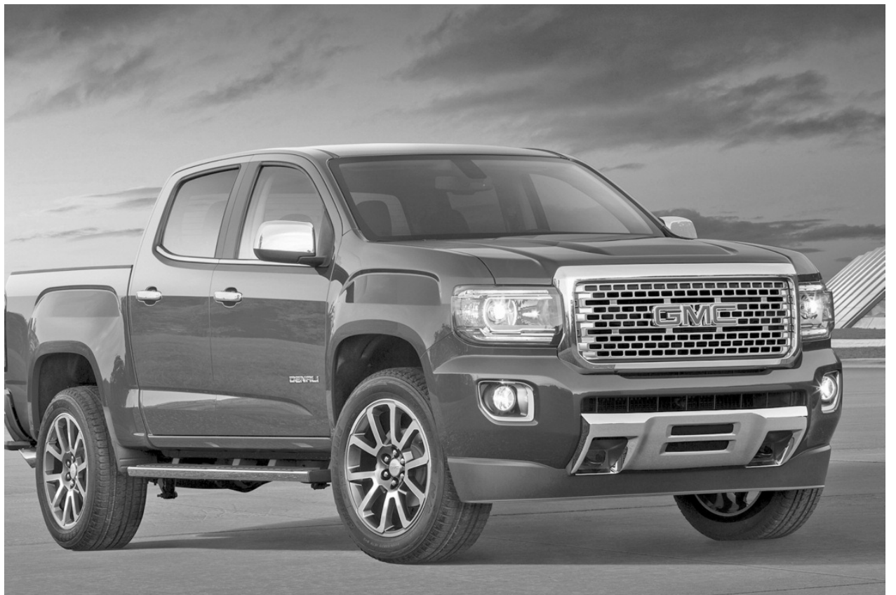
Denali is the ultimate expression of GMC's professional grade style, luxury and capability - and it is coming to the Canyon midsize truck.